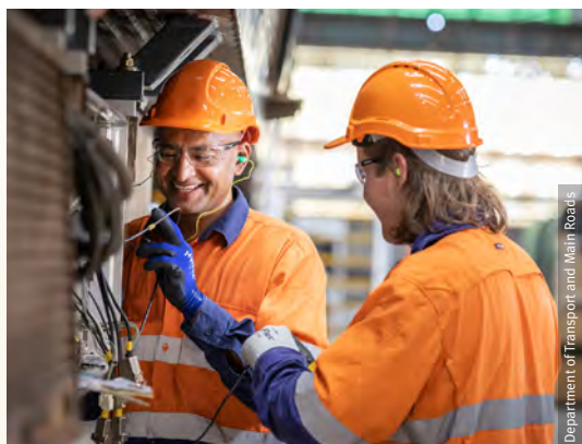
Department of Transport and Main Roads

$170.5 million in 2023-24 out of a $1 billion total spend to construct a new highway between the existing Bruce Highway interchange at Woondum, south of Gympie, and Curra. This investment will improve traffic flow, safety, flood immunity and travel times, and is estimated to support an average of 576 direct jobs over the life of the project. Delivered in partnership with the Australian Government.