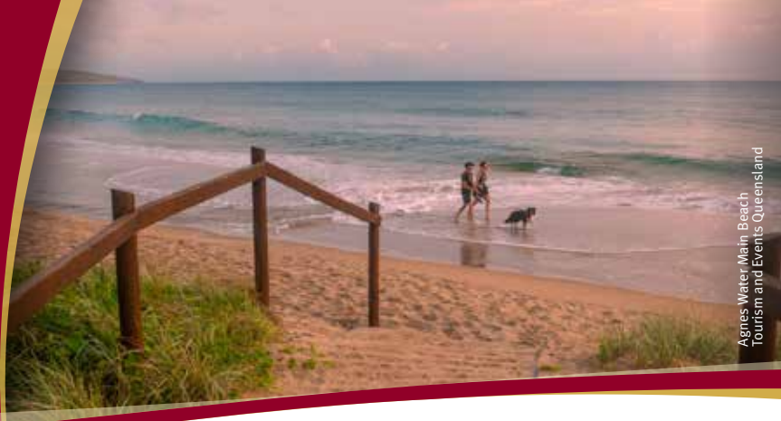
Agnes Water Main Beach Tourism and Events Queensland

The 2022-23 Queensland Budget supports good jobs , provides better services for all Queenslanders and protects our great lifestyle . In Central Queensland it provides: